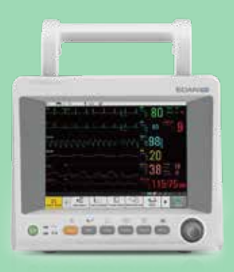
iM50 Patient Monitor