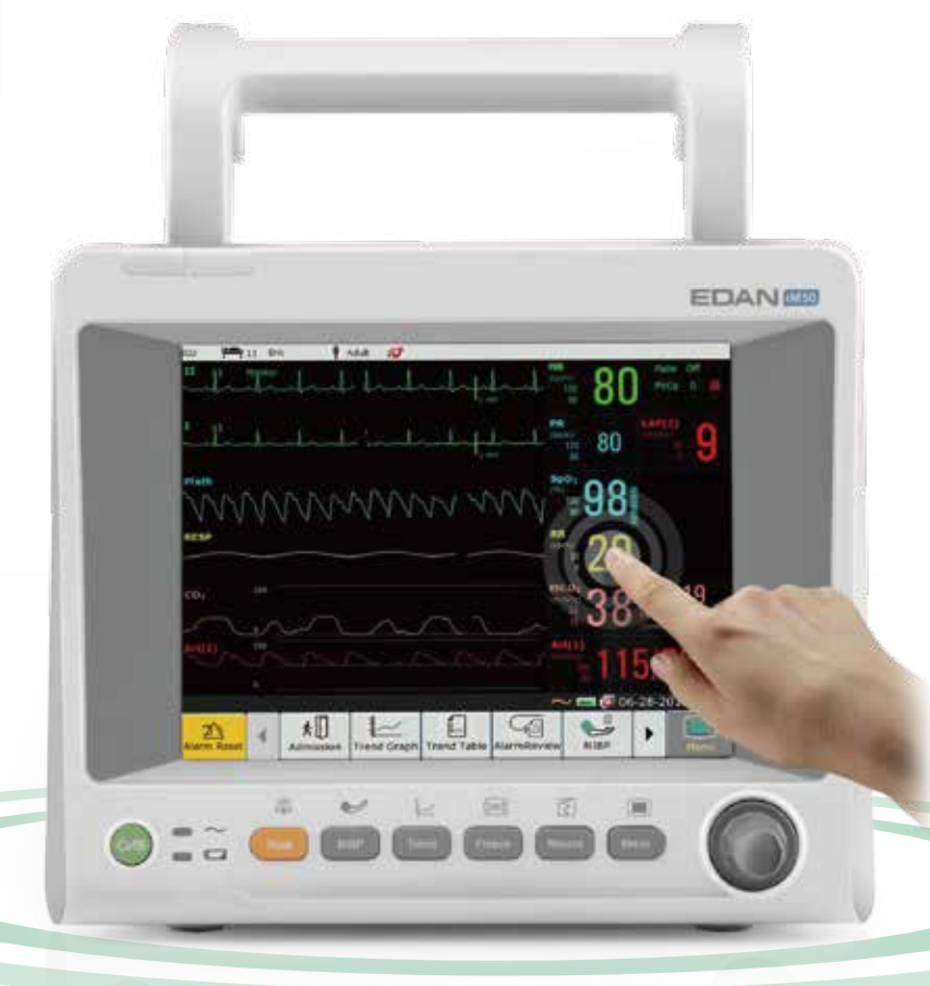
Maximum 13 Waveforms