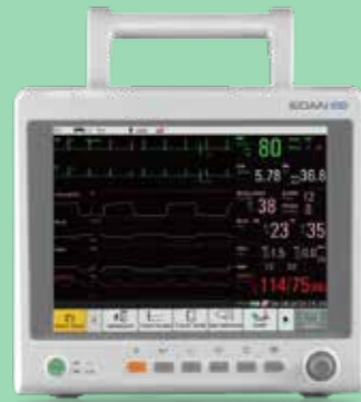
iM70 Patient Monitor